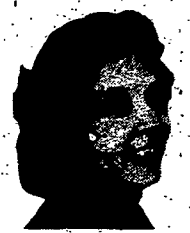
All in the Family