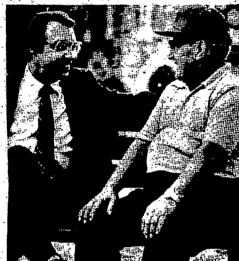
Chatting with a resident of the Veteran's Hospital in Bath.