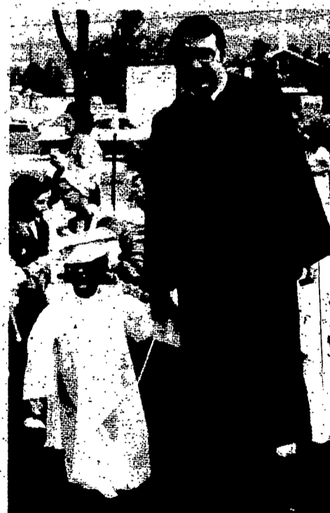
With "Headstart" graduate commencement address.