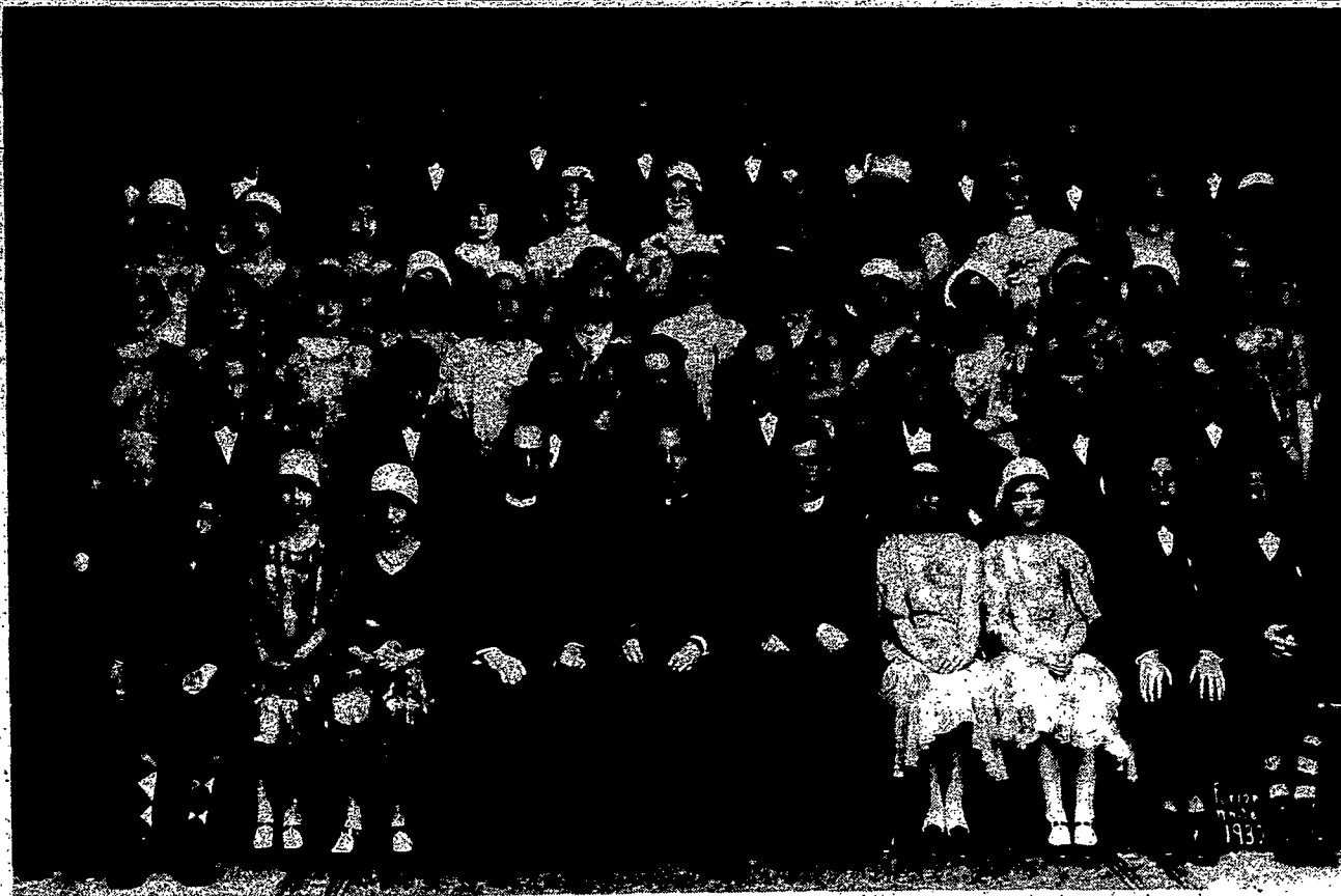
The members of St. Augustine's School class of 1930 will attend their 50th year reunion at the Wishing Well, Friday, Nov. 7 at 7 p.m. Members of the class who have not been notified of the event, or who want ad-