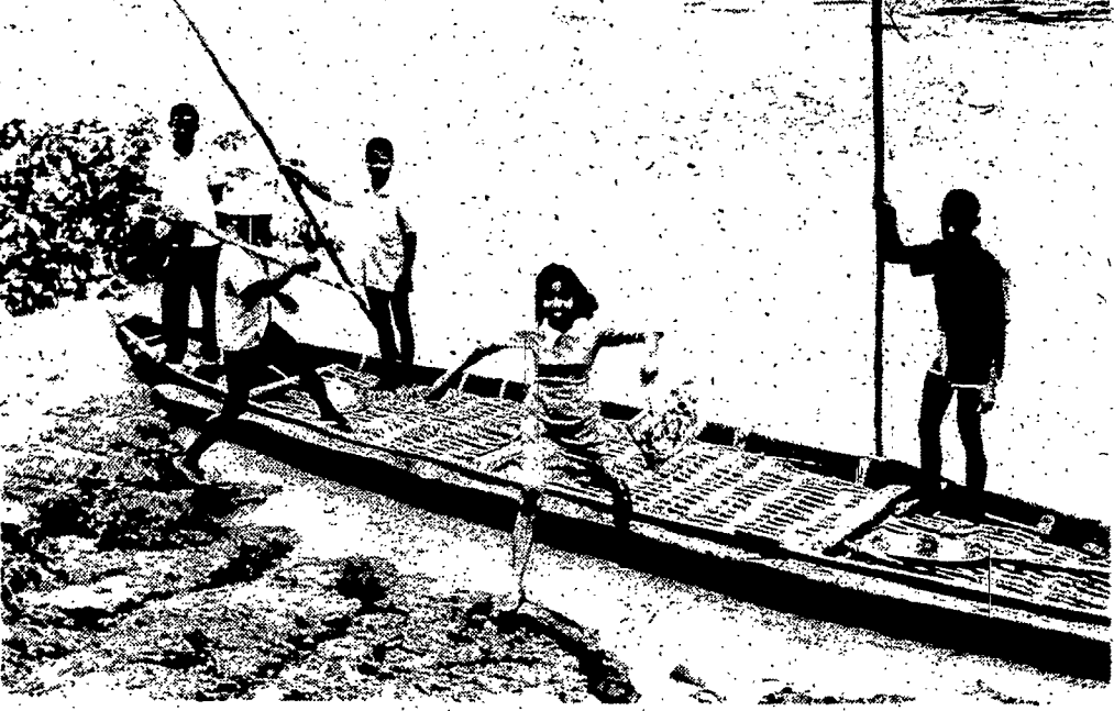
Catechists combine the functions of CCD teacher, prayer leader, social worker and member of the parish council. They help to keep the faith alive and the Christian community active. This woman catechist in Indonesia visits one of the many areas a priest can reach only a few times a year. Please remember her, and all catechists, in your prayers and sacrifices on Mission Sunday, October 19th.