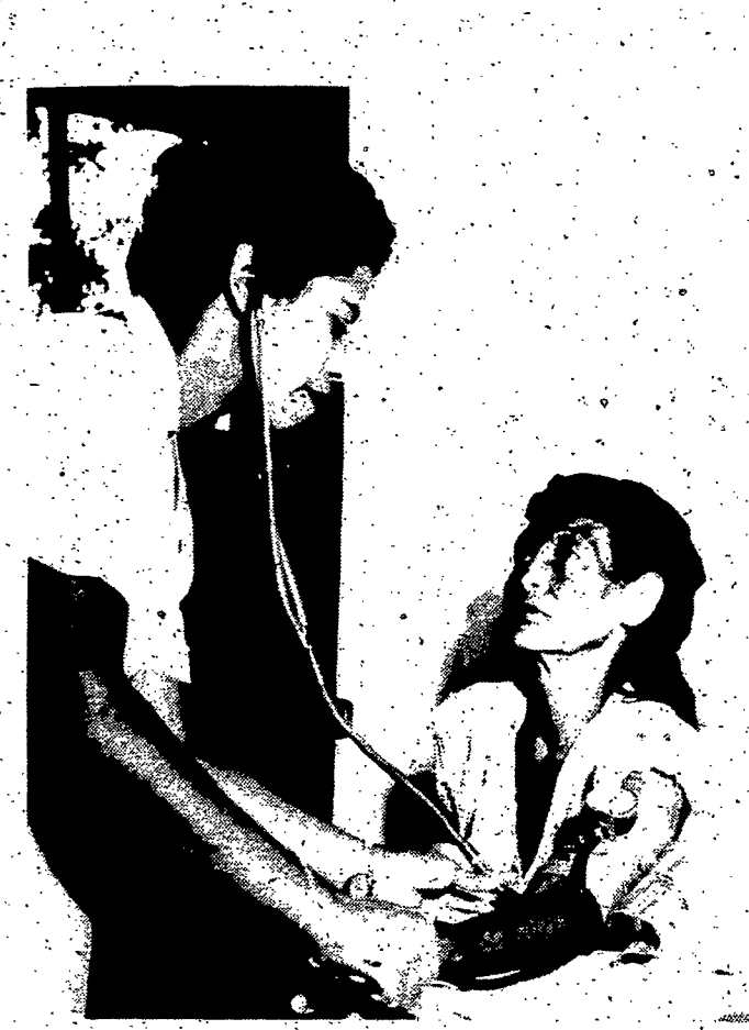
Miracles of healing followed Our Lord's preaching. They gave, as it were, the divine "seal of approval" to His words. Healing the body as well as the soul is also the work of the Church around the world. Would you help that work on October 19th? Thank you!