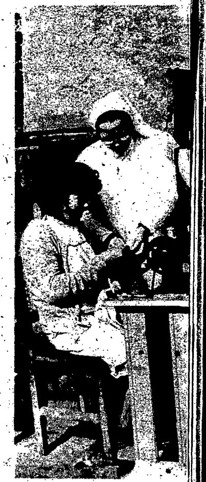
Social service is one of the tal Here, a Sister in Paraguay he living by teaching them to se through a sewing cooperative the thousands like them, on I