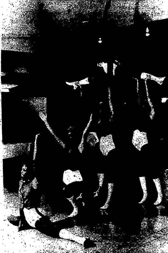
The Buffalo Bills football team's cheering section demonstrating one of the many routines to be seen at the Bill's games at Rich Stadium.