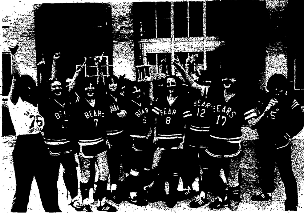
Members of the undefeated St. Agnes "Aggie Bears" soccer team show off their latest acquisition, the championship trophy from the Sodus Invitational Tournament.