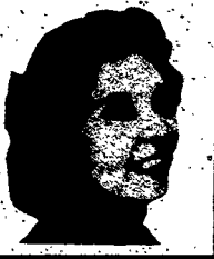
All in the Family