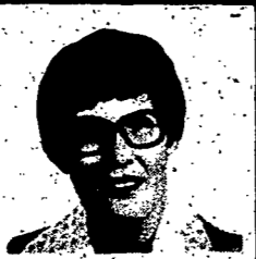
Talks With Parents