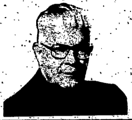
On the Right Side