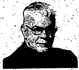
On the Right Side