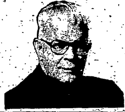
On the Right Side