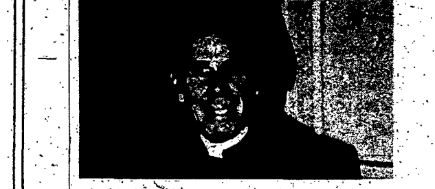
Archbishop Sheen served on the CMMB board over 27 years quietly and without fanfare.

He once placed his face alongside a Leprosy Patient in a mission hospital and said, "I will remember you in a very special way... always." Keep his spirit alive — by helping those he loved so much — the sick — poor! (Today, over 15 million suffer from Leprosy. With proper medication it can be controlled and even cured.)