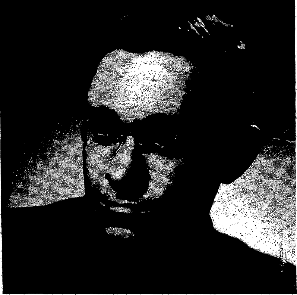
Portrait of the bishop as a young priest . . . ordination photo March 1945.