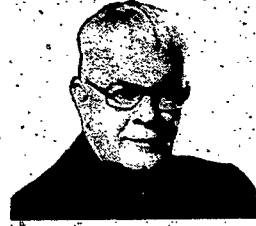
On the Right Side