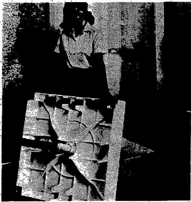
This do-it-yourself shower stall solves the big problem of installing a drain under the stall. Using this high base, the water drains out to a remote drain. For more information get in touch with Plaskolite, Inc., 1770 Joyce Avenue, Box 1497, Columbus, Ohio 43216.

When householders want to improve their bathrooms or add a shower somewhere else at little expense doing it themselves is one way to keep down the cash outlay.