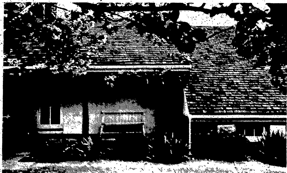
When it comes time to reroof, there's no reason to settle for less than the utmost in color and texture. These three-dimensional asphalt shingles in a striking earthtone shade offers years of easy-care protection while improving a home's curb appeal.

If color and texture play such a vital role in the exterior appearance of a home, why should the roof remain dull and lifeless? It shouldn't.