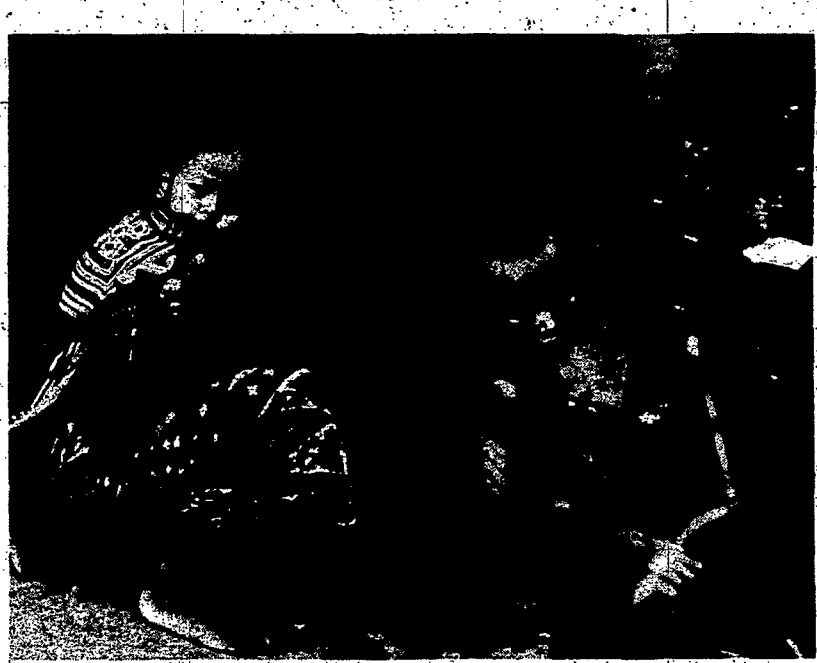
The ravages of war.

Cambodian Relief 123 East Ave. Rochester, N.Y. 14604