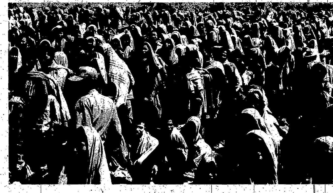
A sea of faces: Cambodian refugees line up for food in a Thailand camp.