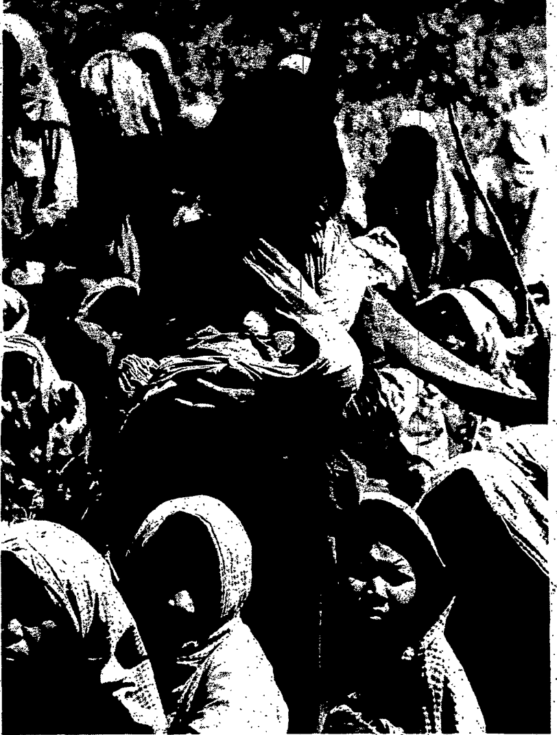
A Cambodian madonna and child.