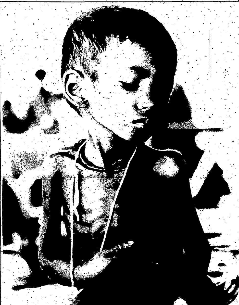
A young Cambodian child sits listlessly in the Sa Kaew refugee camp in Thailand, apparently too weak to eat. Doctors report that many children have not eaten for so long they clamp their mouths shut when offered food.