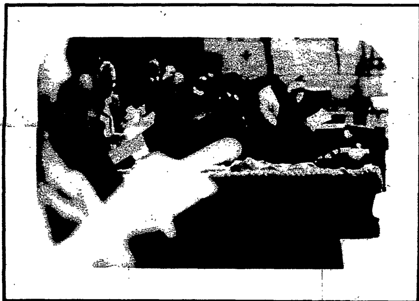
The body of Archbishop Sheen lies in state in St. Patrick's Cathedral.