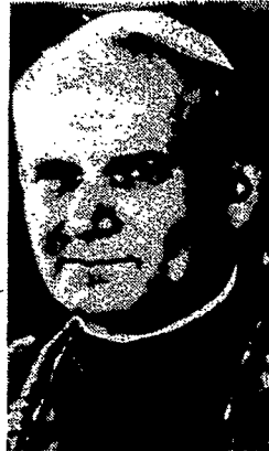
POPE JOHN PAUL II