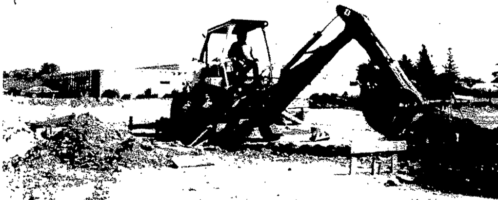
Work began on the new church in August 1978, as can be seen here as the ground was prepared for the footings. In the background is the parish school.