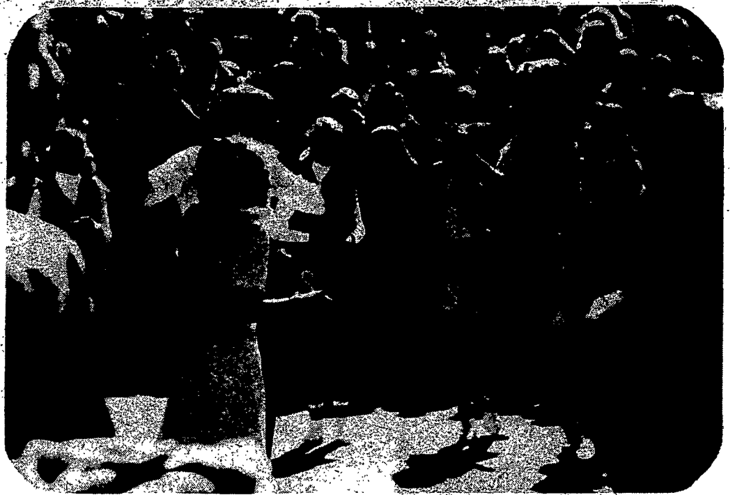
A giant pep rally was held the day before the school's Field Day and each class presented a cheering squad in competition.