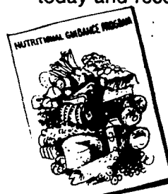
FREE! Nutritional Guidance booklet

Padre Pio, the "Apostle of the Confessional," bore wounds for 50 years that were said to be like those that Christ received on the cross.