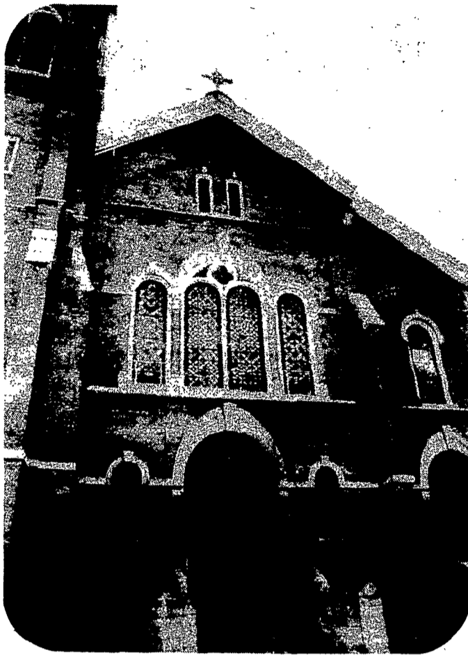
St. Bridget's door is open to many community groups.