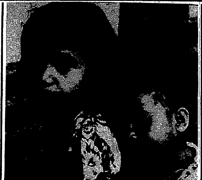
... the main tragedy remains the mounting toll of human lives and the refugees whose homes have been destroyed. Deaths run into the thousands.