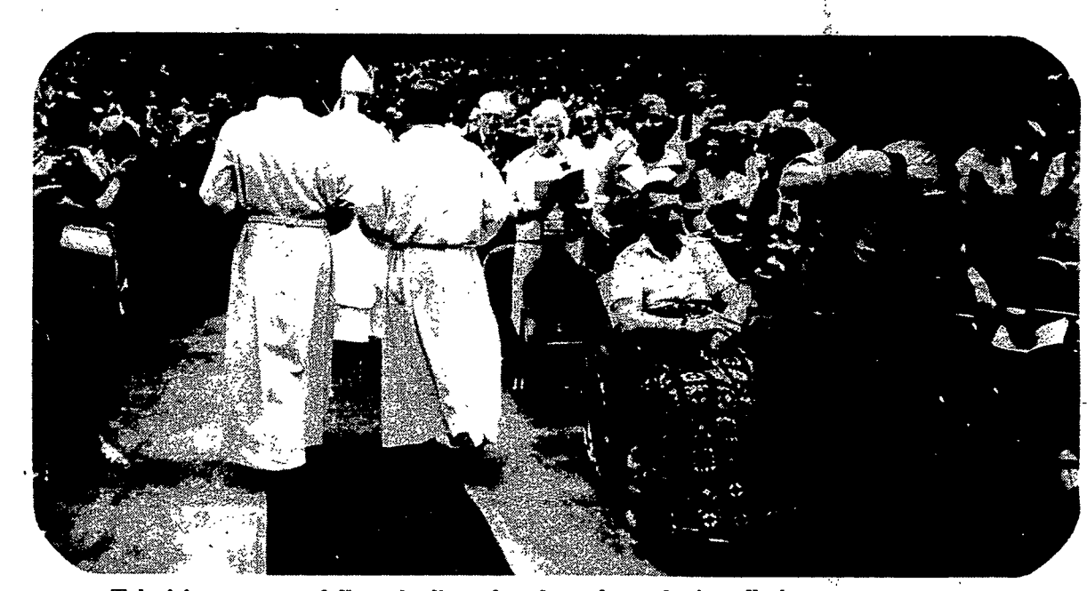
Television cameras follow the line of prelates from the installation.