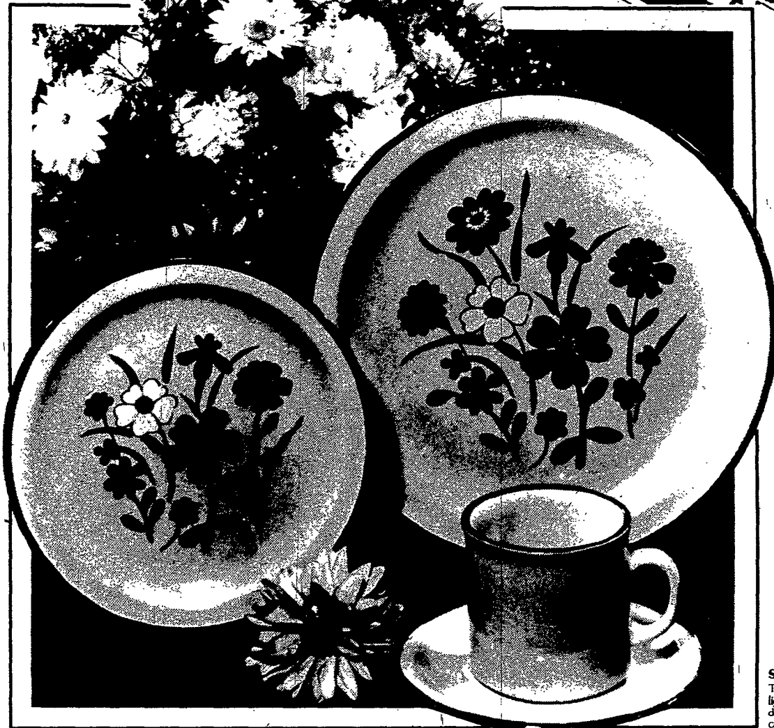
Spring Flower This day-brightening pattern is light, cheerful and impressive. A delightful design for today's casual living.