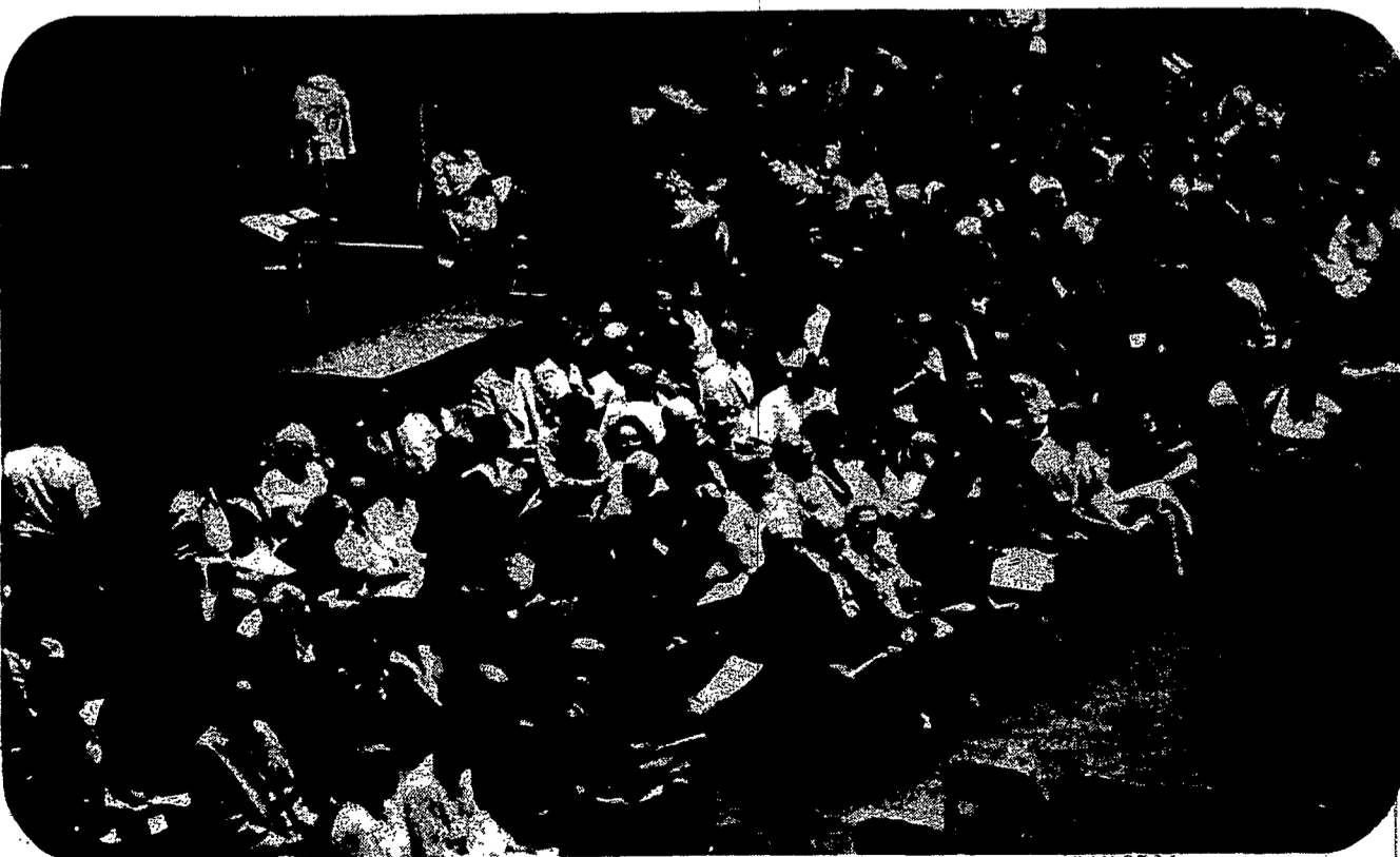
Eucharistic Ministers await instructions.