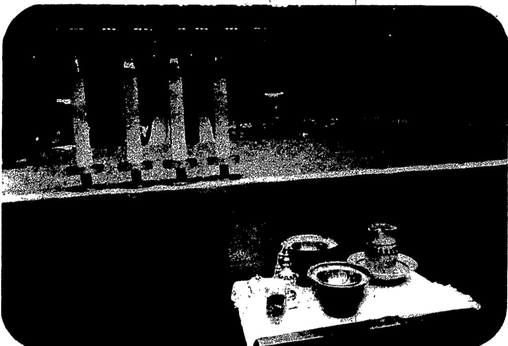
A table bearing incense is hidden from view behind the broad expanse of the altar platforms.