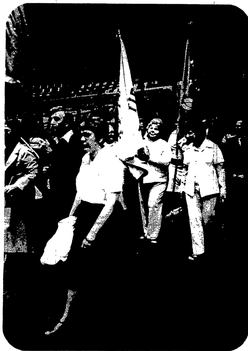
Flags representing diocesan regions lead the procession.