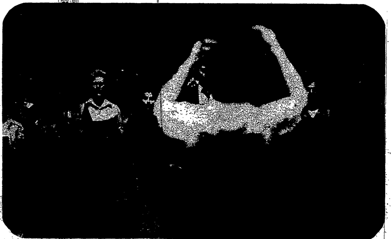
A special choir whose members come from across the diocese sings at the rehearsal.