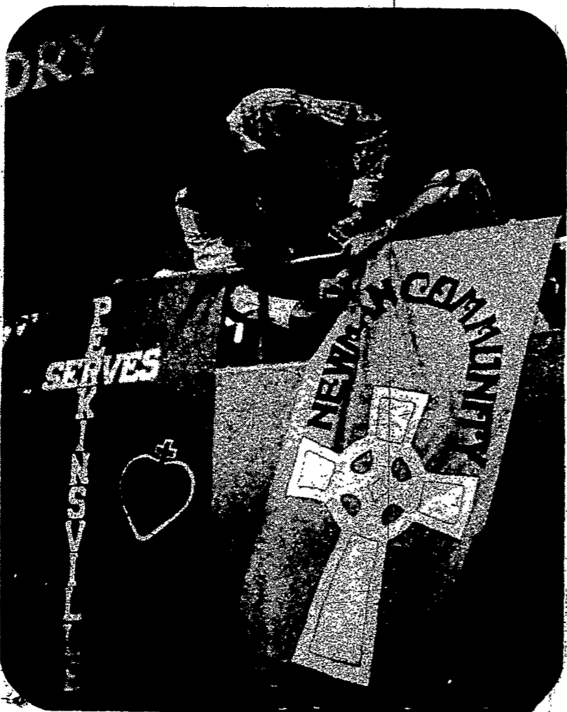
Banners representative Catholic communities throughout the diocese festoon the arena.