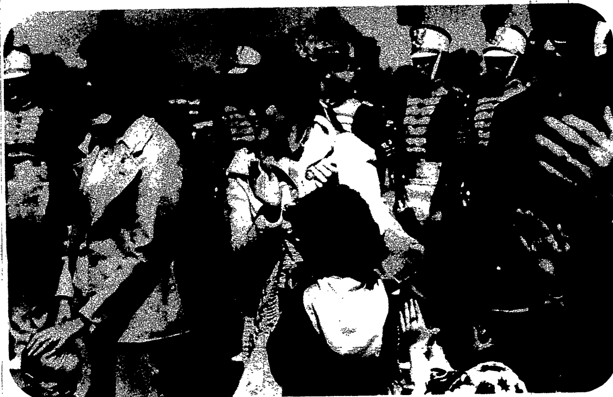
The crowd breaks into applause at the arrival of the bishop.