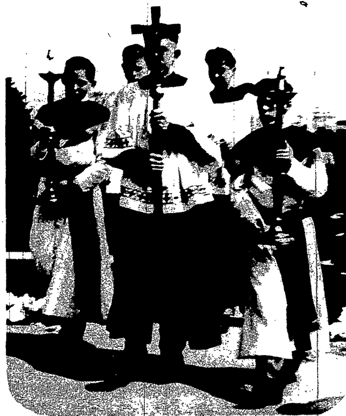
As an acolyte (far left) in a procession to Mass.