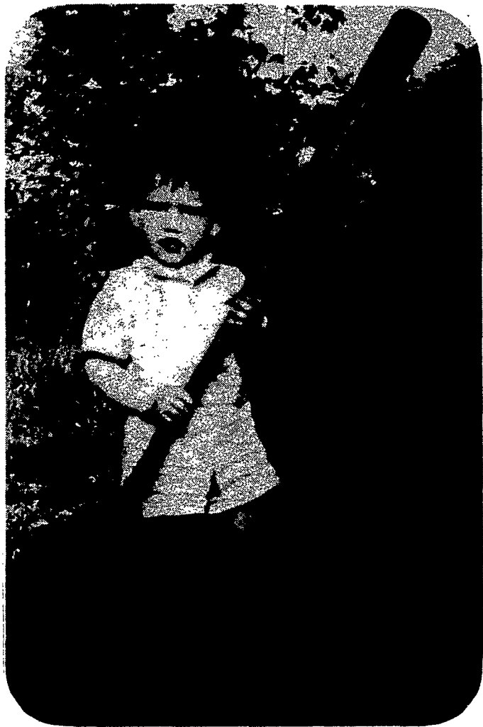
The young slugger.