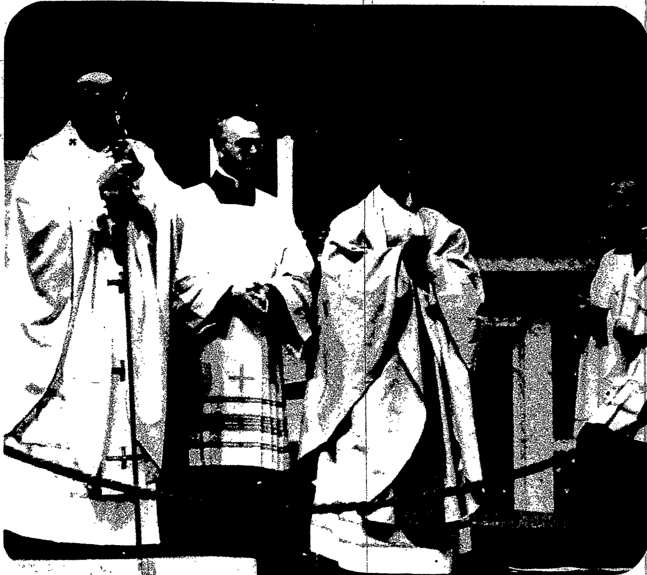
Pope John Paul II holds the crucifix once carried by Pope Paul VI.