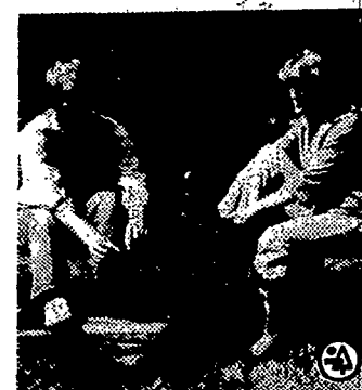
When heavy boots are needed, Bama Socklets keep feet cool and dry.

The high cost of fuel has not stopped this couple from their enjoyment of the Great Outdoors. By maintaining good driving habits and keeping their car in condition, they have increased their pleasure by knowing they are doing their part to keep the Great Outdoors safe and clean.