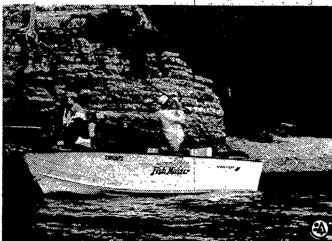
You don't need a snazzy metallflake fiberglass bass boat to haul in lunkers. Take a look at one of the new "everyman's" bass boats, such as the Starcraft Fishmaster. It's a lightweight marine aluminum boat that will come in close to shoreline bass country. It is powerful enough to double as a family ski boat, but economical to buy, tow and operate.