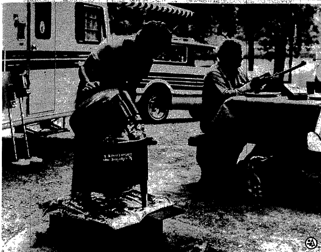
Smokers in the campground or on the patio are a great case for convenience, an even better one for great eating.