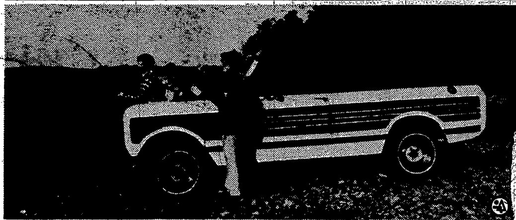
Four-wheel drive vehicles are particularly appealing to outdoor sportsmen. The excellent traction, good ground clearance and large cargo space these vehicles commonly offer are all useful features for hunting and fishing trips.