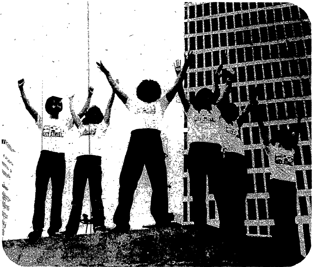
City Streets on city streets.