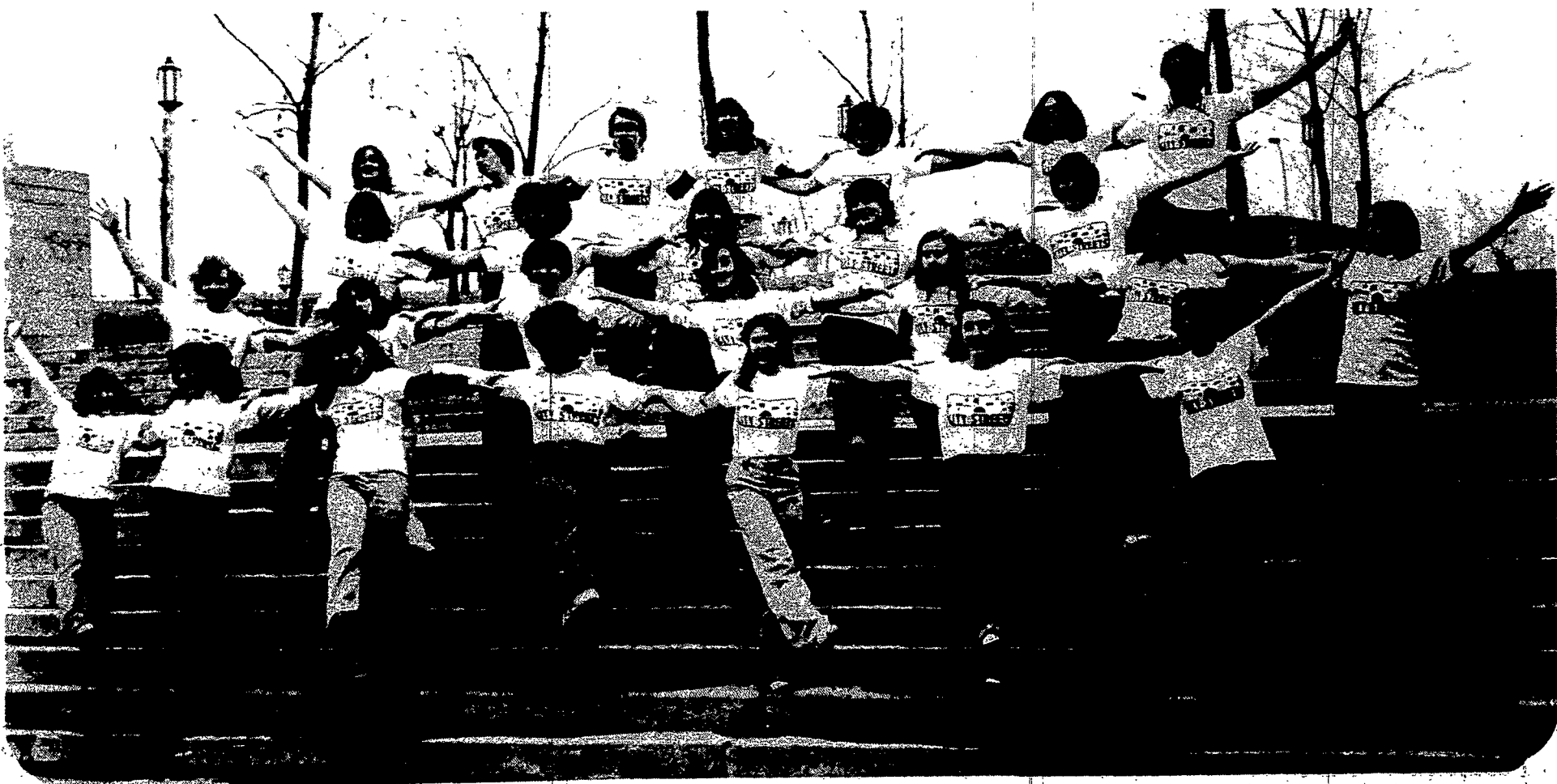
Cast members go through a dance number.