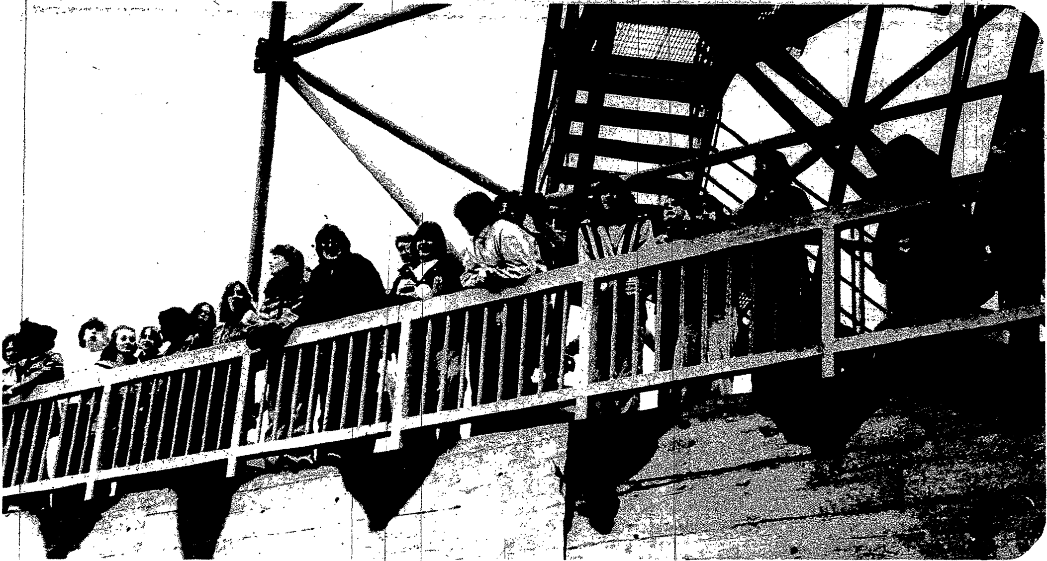
The cast enjoys the view from the Space Platform.