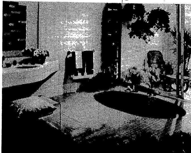
IF YOU SCORED MOSTLY A'S, a sybaritic bath with a sunken tub and sunning patio is for you.