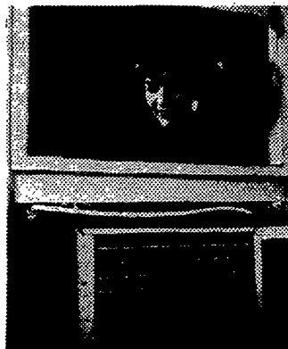
SEAL WINDOW-MOUNTED air conditioners with Schlegel foam. Self-adhesive back speeds installation.