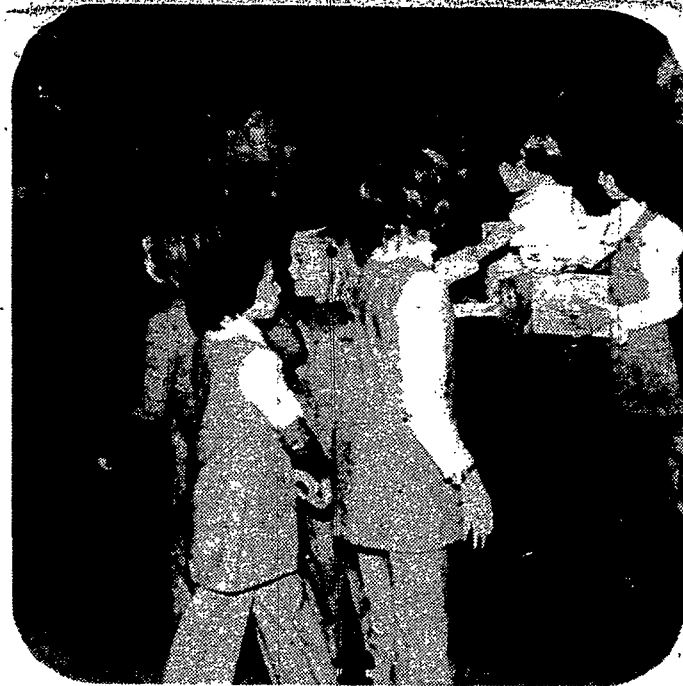
Girl Scouts shown above deposit contributions to the Juliet Low Friendship Fund.