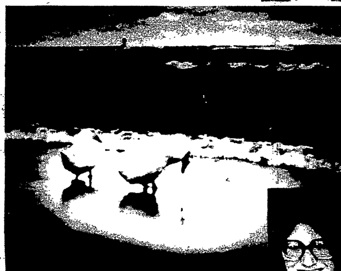
Bishop Kearney