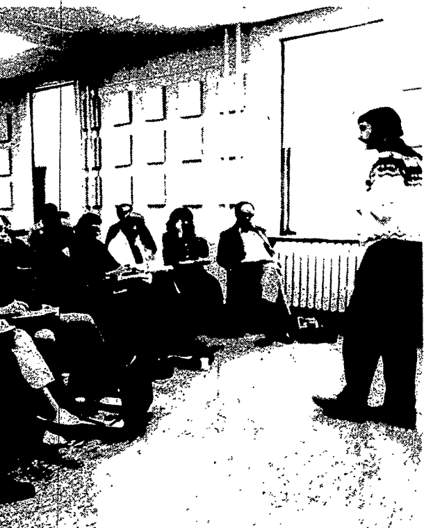
estament to permanent diaconate candidates.