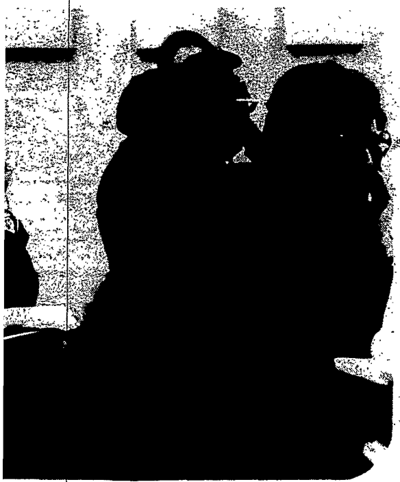
re, administers the program for the per- cent over a joke delivered in one of the classes.