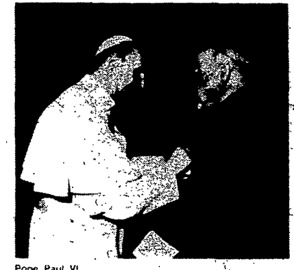
The Knights of Columbus are "an immense force for good."