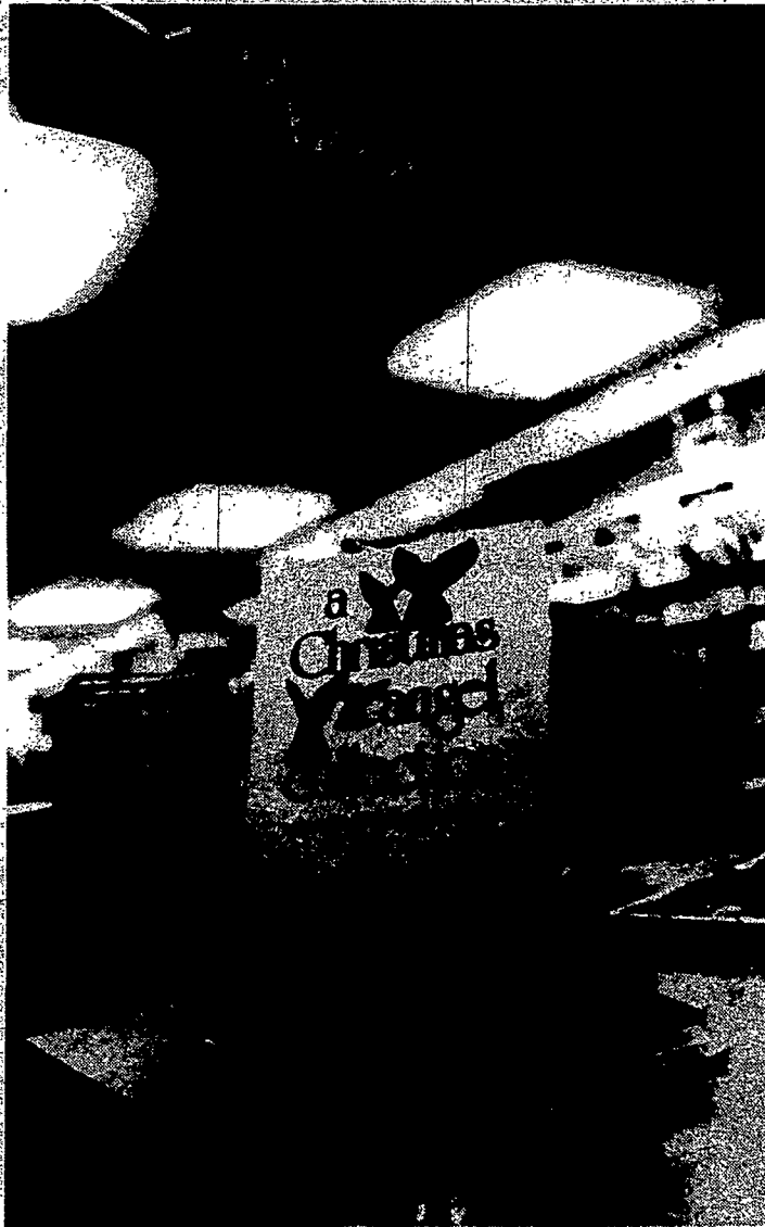
Religious themes abound in books for children this year. Photo taken at Walden Books, Midtown Plaza.

Several new books begin with the birth of Jesus and