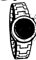
Seiko Longiner & Wittnauer Watches

Artistic Wedding Rings and Diamond Mountings