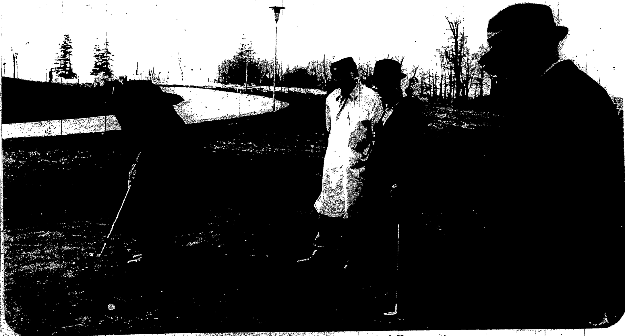
Practicing putting with senior citizens at St. Ann's Home.