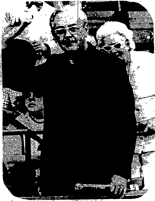
Throwing out first ball at Courier-Journal night at Silver Stadium.