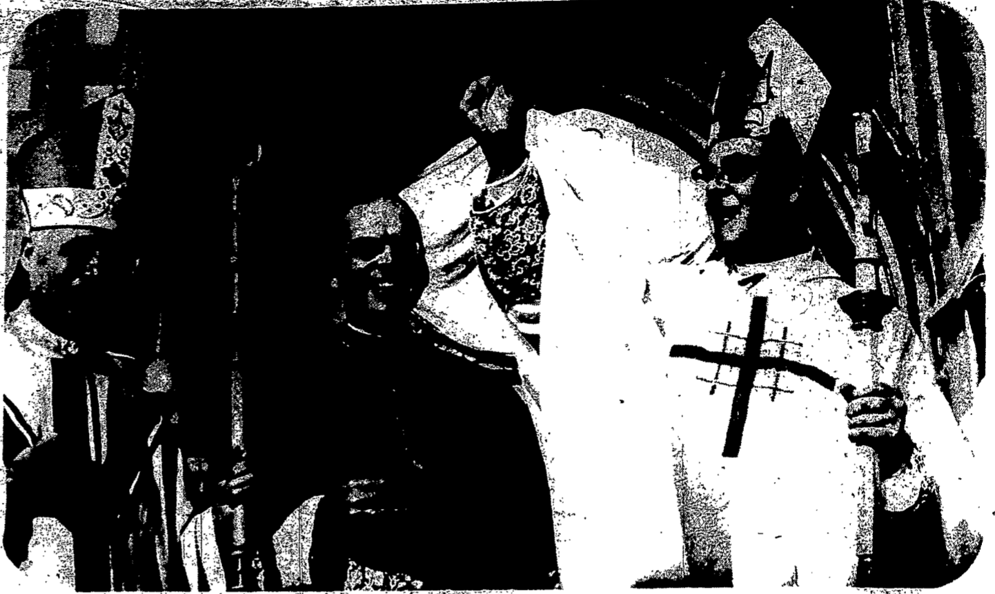
With Archbishop Raimondi and Cardinal Cooke.