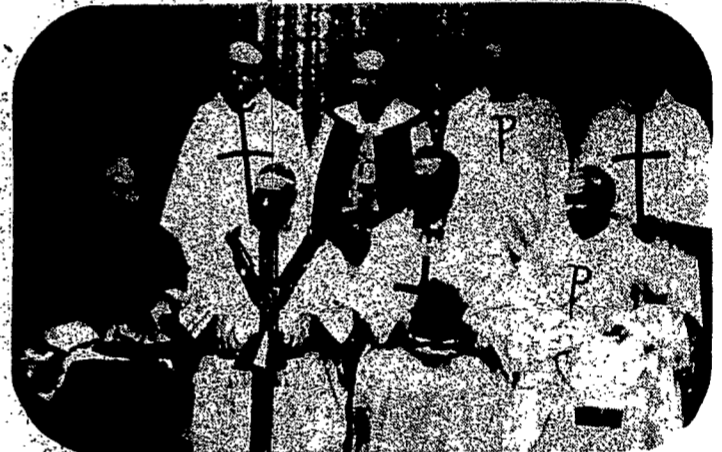
Front row, Cardinal Cooke, Archbishop Raimondi, Bishop Hogan, Archbishop Sheen; rear, Bishops Hickey, Kearney, Casey and McCafferty.