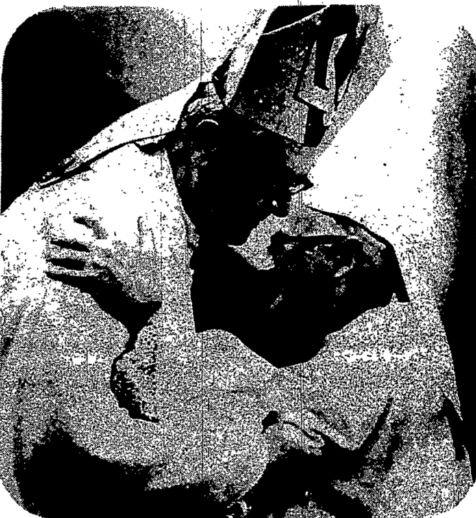
Bishop Hickey extends the Sign of Peace.