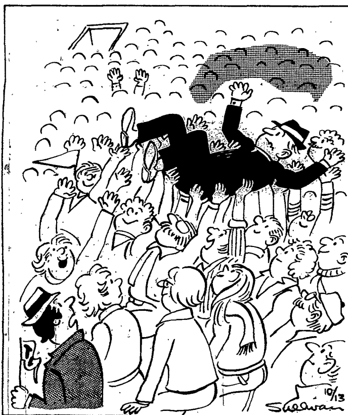
IT'S USUALLY A COEP, BUT I SHOULD'VE FIGURED THIS WOULD HAPPEN WHEN WE PLAYED NOTRE DAME!

that a newspaper reporter cannot withhold information sought by a defendant in a criminal case. Now that the press is being hurt, they are beginning to wake up, we hope and pray, to the principle that if one person's rights are trampled, eventually no