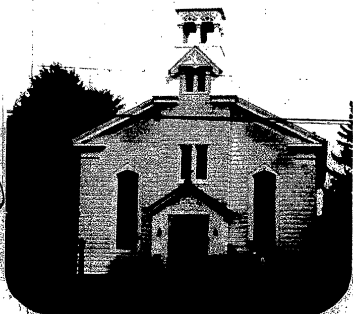
St. Michael's, Livonia