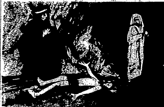
He recognized a need

The commitment — agreement comes first. Without the initial agreement by the parishioner to give their Time, Talent and Treasure, the concept of improving parish life, both for you and your family and your fellow parishioner, becomes impossible.